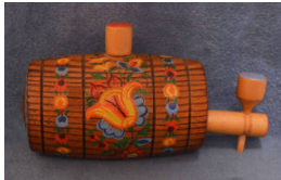
Title: Decanter Date: 1974 Medium: wood