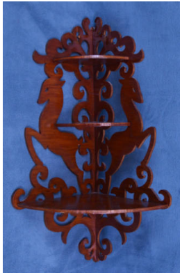
Title: Shelf Medium: wood