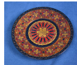
Title: Plate Medium: wood