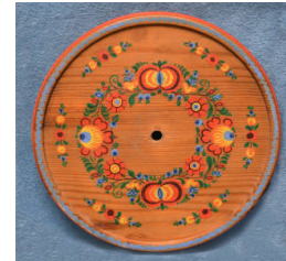
Title: Plate Date: 1974 Medium: wood