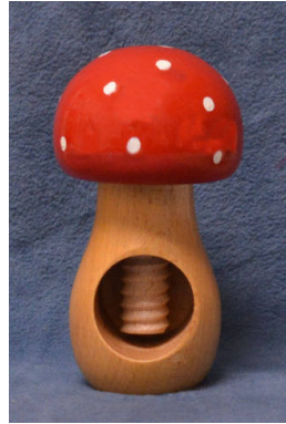
Title: Whimsy Medium: wood