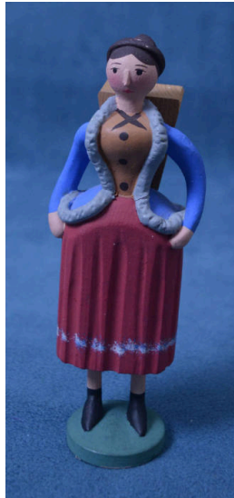
Title: Figure Date: 1927-1995 Medium: wood