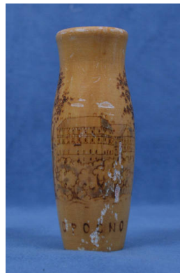
Title: Vase Medium: wood