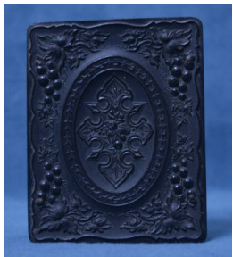
Title: Frame, Picture Medium: wood, metal, glass