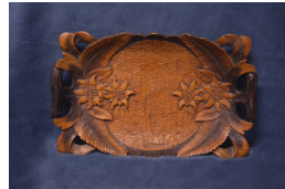
Title: Tray Date: 1937 Medium: wood