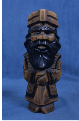
Title: Figure Medium: wood