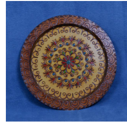
Title: Plate Medium: wood