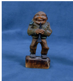
Title: Figure Medium: wood