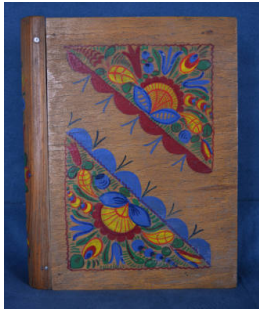
Title: Box, Book Medium: wood