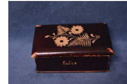
Title: Box, trinket Date: 1937 Medium: wood