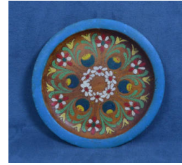
Title: Plate Medium: wood