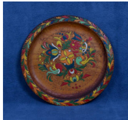
Title: Plate Medium: wood