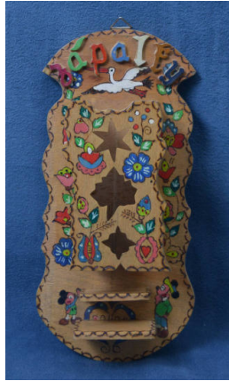
Title: Holder, Matchstick Medium: wood