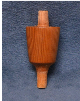
Title: Stand Date: 1974 Medium: wood