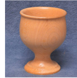
Title: Cup, egg Medium: wood