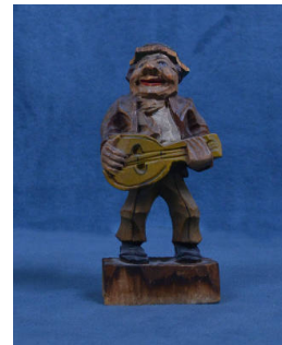
Title: Figure Medium: wood