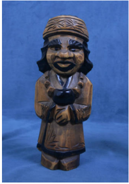
Title: Figure Medium: wood