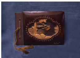
Title: Album, photograph Date: 1937 Medium: wood