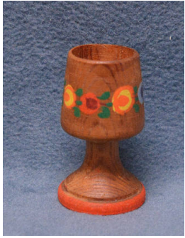
Title: Cup Date: 1974 Medium: wood