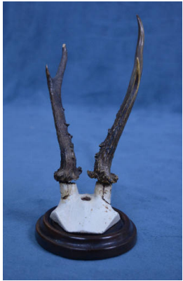
Title: Horns, Elk Medium: bone, wood