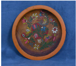
Title: Plate Medium: wood