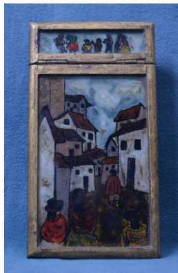
Title: Painting Medium: wood, metal, glass