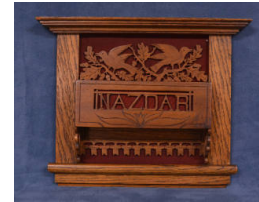
Title: Box, Wall Medium: wood, textile