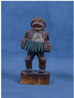
Title: Figure Medium: wood