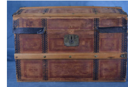
Title: Trunk Date: 1850-1859 Medium: wood, metal