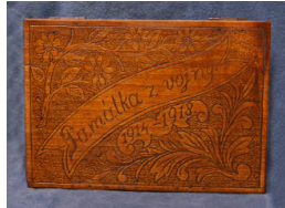
Title: Case, shaving kit Date: 1914-1918 Medium: wood, metal