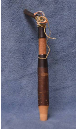
Title: Component, pipe Date: 1909 Medium: wood, plastic, textile