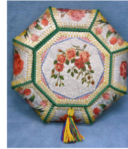
Title: Box, trinket Medium: textile, paper?, wood, metal