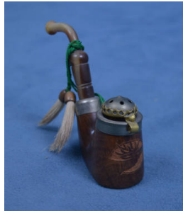
Title: Pipe Medium: wood, metal, plastic, textile