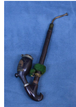
Title: Pipe Medium: wood, metal, fur