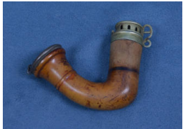
Title: Pipe Medium: wood, metal, plastic