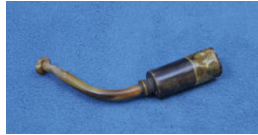
Title: Pipe component Medium: plastic