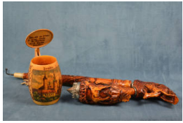
Title: Pipe Medium: wood, metal