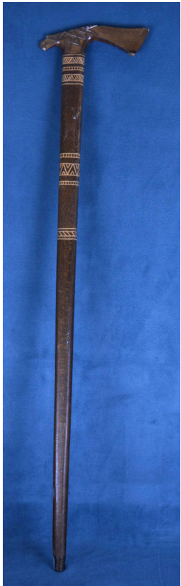
Title: Cane Medium: wood, metal