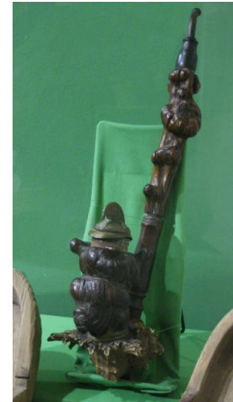
Title: Pipe Medium: wood, metal, shell, plastic