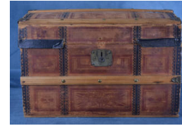
Title: Trunk Date: 1850-1859 Medium: wood, metal