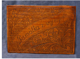
Title: Case, shaving kit Date: 1914-1918 Medium: wood, metal