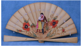
Title: Fan Medium: wood, textile, metal, plastic