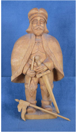
Title: Figure Medium: wood