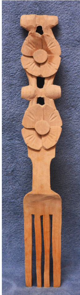
Title: Fork Medium: wood