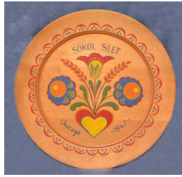
Title: Plate Date: 1947 Medium: wood