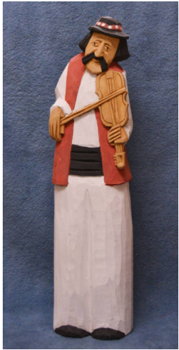
Title: Figure Medium: wood