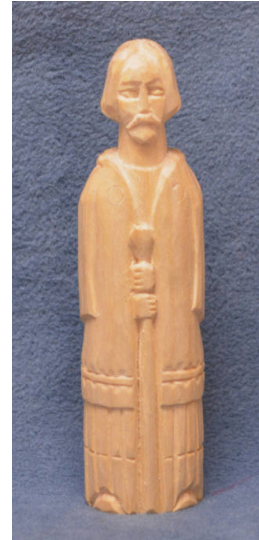
Title: Figure Medium: wood