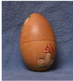
Title: Egg Medium: wood