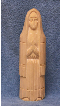
Title: Figure Medium: wood