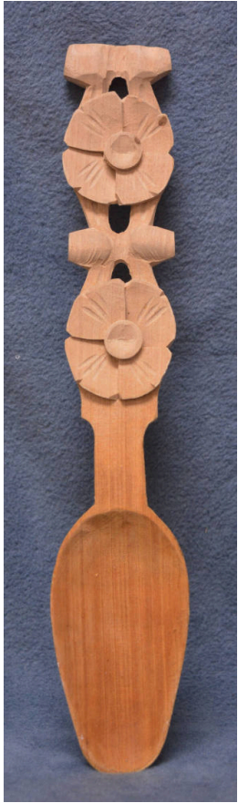
Title: Spoon Medium: wood