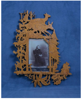
Title: Photo, framed Date: 1918 Medium: wood, glass, paper