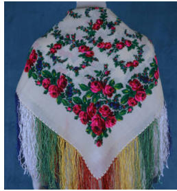
Title: Shawl Medium: Textile