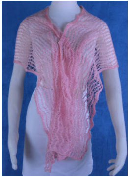
Title: Shawl Date: 1900-1905 Medium: Textile