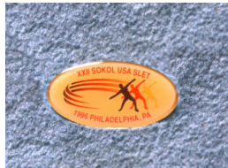
Title: Pin Date: 1996 Medium: metal