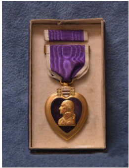
Title: Medal Date: 1935 Medium: metal, textile