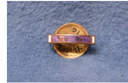
Title: Fragment Date: 1935 Medium: metal