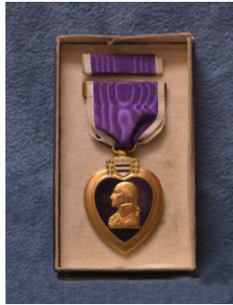
Title: Medal Date: 1935 Medium: metal, textile