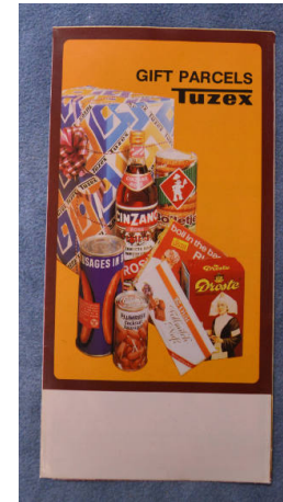
Title: Brochure Date: 1985 Medium: cardstock