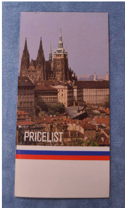
Title: Brochure Date: 1984 Medium: paper