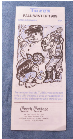
Title: Brochure Date: 1989 Medium: paper