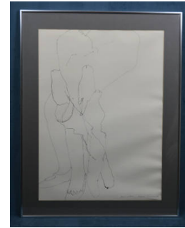
Title: Untitled Date: 1970 Medium: ink on paper