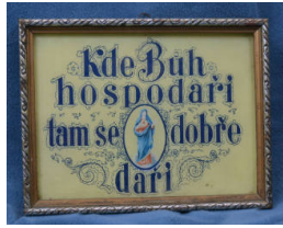
Title: Calligraphy, framed Medium: wood, paper, glass, metal