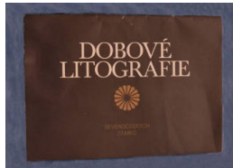
Title: Folio, lithograph Date: 1986 Medium: paper, cardstock