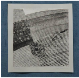
Title: Untitled Date: 1964 Medium: etching on paper