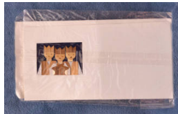
Title: Card, Christmas Medium: cardstock, wheat