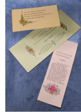
Title: Writings, embellished Date: 1890-1939 Medium: paper, cardstock