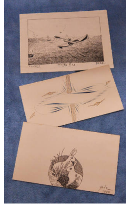
Title: Drawings Date: 1883-1920 Medium: paper, cardstock