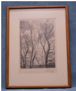
Title: Drawing Date: 1890-1962 Medium: paper, wood, plexi