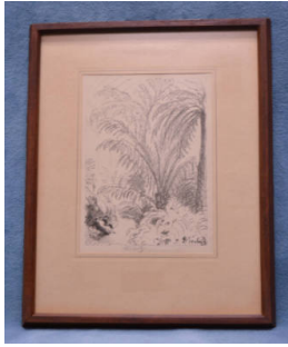
Title: Drawing Date: 1890-1962 Medium: paper, wood, plexi