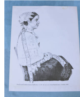
Title: Drawing Date: 1982 Medium: paper