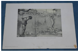
Title: Drawing Medium: paper