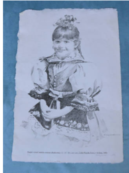
Title: Drawing Date: 1983 Medium: paper