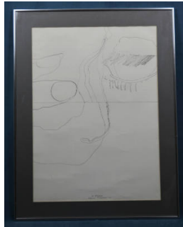
Title: Untitled Date: 1970 Medium: ink on paper