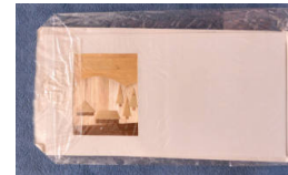
Title: Card, greeting Medium: cardstock, wheat