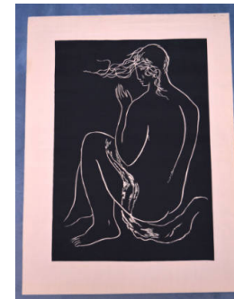
Title: Drawing Date: 1890-1962 Medium: paper