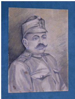
Title: Drawing Date: 1969 Medium: pencil on paper