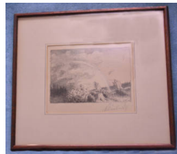
Title: Drawing Date: 1890-1962 Medium: paper, wood, plexi