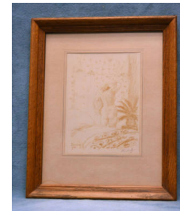
Title: Drawing Date: 1890-1962 Medium: paper, wood, plexi