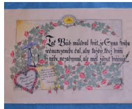
Title: Caligraphy Date: 1957 Medium: paper