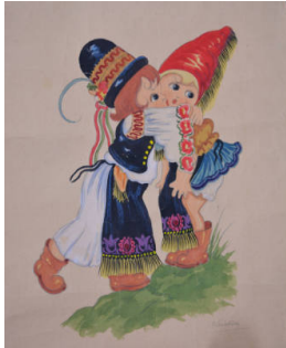
Title: Drawing Medium: paper