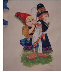
Title: Drawing Medium: paper