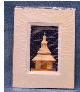
Title: Hanging, wall Medium: cardboard, matboard, wheat