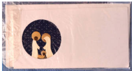
Title: Card, Christmas Medium: cardstock, wheat