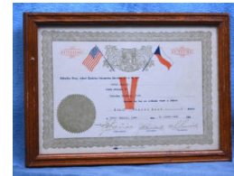
Title: Certificate, framed Date: 1943 Medium: paper, wood, glass