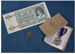
Title: Currency Date: 1931 Medium: Paper