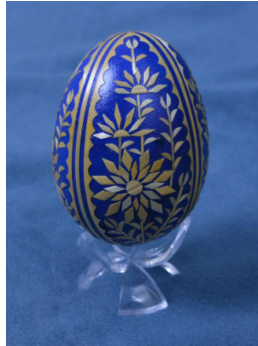
Title: Egg Date: 1998 Medium: egg shell