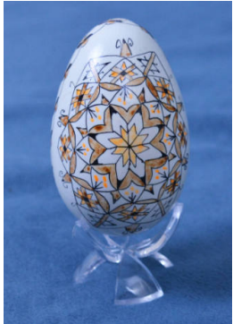
Title: Egg Medium: egg shell