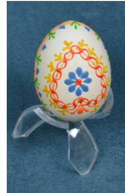
Title: Egg Medium: Egg, wax