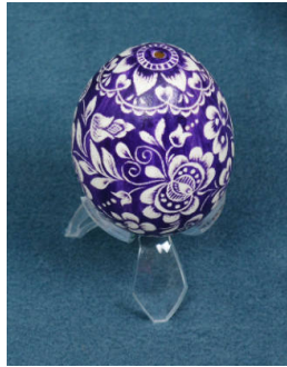
Title: Egg Date: 1984 Medium: Egg