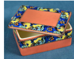
Title: Box Medium: ceramic