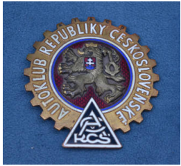
Title: Badge Date: 1948 Medium: metal