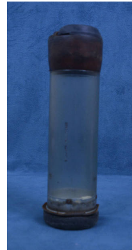
Title: Tube, Mailer Medium: metal, leather, plastic, rubber