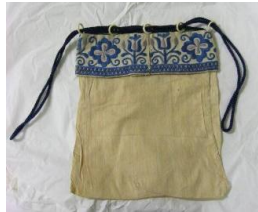
Title: Bag Medium: Textile