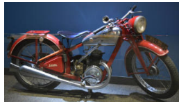
Title: Motorcycle Date: 1930 Medium: Metal, rubber