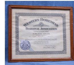
Title: Certificate, framed Date: 1938 Medium: paper, wood, glass