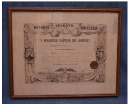
Title: Certificate, framed Date: 1891 Medium: paper, wood, glass, metal