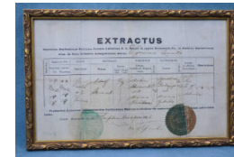
Title: Certificate, baptismal Date: 1925 Medium: paper, wood, glass