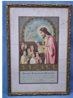
Title: Certificate Date: 1928 Medium: paper, wood, glass