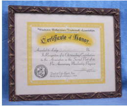
Title: Certificate, framed Date: 1945 Medium: paper, wood, glass