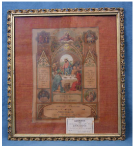
Title: Certificate Date: 1882 Medium: paper, textile, wood, glass