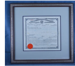
Title: Certificate Date: 1914 Medium: paper, metal, glass