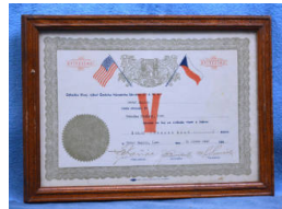
Title: Certificate, framed Date: 1943 Medium: paper, wood, glass