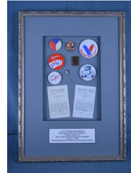
Title: Framed, Certificate Date: 1990 Medium: paper, metal, mat board, wood, glass