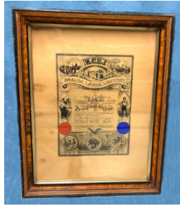
Title: Certificate, framed Date: 1901 Medium: paper, glass, wood