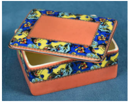
Title: Box Medium: ceramic