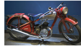
Title: Motorcycle Date: 1930 Medium: Metal, rubber