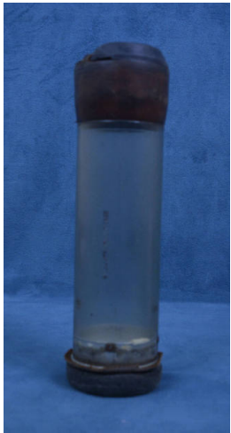
Title: Tube, Mailer Medium: metal, leather, plastic, rubber