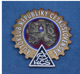
Title: Badge Date: 1948 Medium: metal