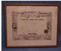
Title: Certificate, Framed Date: 1891 Medium: paper, wood, glass, metal