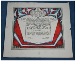
Title: Certificate Date: 1920 Medium: paper