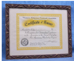
Title: Certificate, framed Date: 1945 Medium: paper, wood, glass