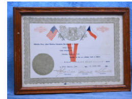
Title: Certificate, framed Date: 1943 Medium: paper, wood, glass