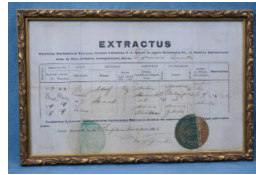
Title: Certificate, baptismal Date: 1925 Medium: paper, wood, glass