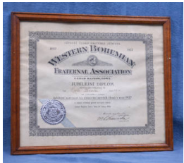
Title: Certificate, framed Date: 1938 Medium: paper, wood, glass