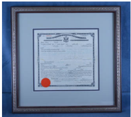
Title: Certificate Date: 1914 Medium: paper, metal, glass