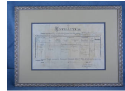
Title: Certificate Date: 1923 Medium: paper, metal, glass