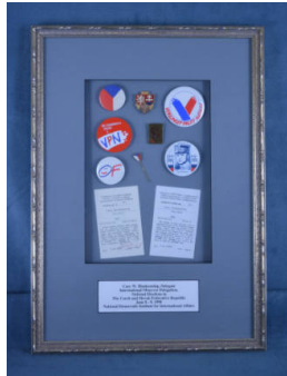
Title: Framed, Certificate Date: 1990 Medium: paper, metal, mat board, wood, glass