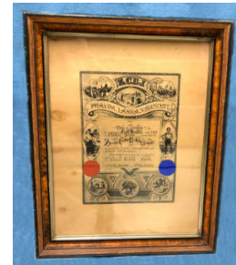
Title: Certificate, framed Date: 1901 Medium: paper, glass, wood