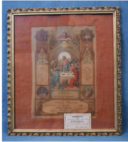
Title: Certificate Date: 1882 Medium: paper, textile, wood, glass